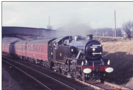
LMS 2-6-4T 42613 approaches Upton-by-Chester (now Bache) at 75 mph with the 15.25 Sundays Birkenhead (Woodside) to London Paddington on 26th February 1967, shortly before through trains on this route ceased.

Lime Kiln Lane - Opened on 30.5.1846 it was renamed Tranmere in 1853.