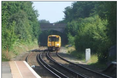
Merseyrail unit near Bebington

Important to note - The closing dates are the first effective date of closure. In some cases stations opened earlier than in the timetable and may have been announced in local newspapers. With the advent of the Railway Clearing House (RCH) in 1842 and many stations opening at the time some things were still not announced, even the RCH itself!