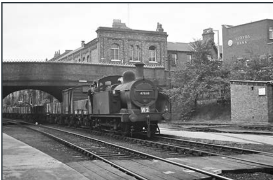
LMS 3F 0-6-0T 47658 shunts within Crewe Works on the 27th September 1964, on the original alignment of the Chester & Crewe Railway; the railway being diverted away from this route as the Works developed on both sides of the railway and caused congestion on it. Consequently a diversion was built on the current alignment; this piece of line is now Dunwoody Way

In such a manner the LNWR was formed in 1846 and concurrently set up its own loco works in the parish of Monks Coppenhall. This name being a mouthful it promptly named this flourishing railway town Crewe - probably the world's most famous railway junction and Chester was connected to it.