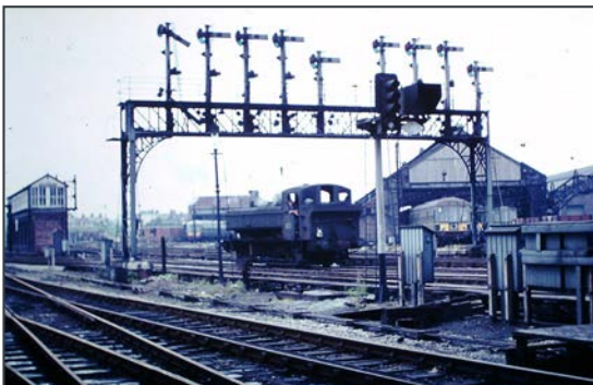
'Hawksworth' 0-6-0PT of GWR origin scuttles past the diesel multiple unit depot, formerly the GWR steam locomotive shed, and under the impressive signal gantry en route to the sidings alongside the station at Chester on 4th July 1966. Unfortunately by this time most ex-GWR engines had had their cabside number plates removed and replaced with painted numerals

The line now mostly enjoys a two trains per hour service one being from Chester or beyond to London. London services are reduced at weekends, particularly on Sunday when there is a late start. The Line is being considered for possible electrification.