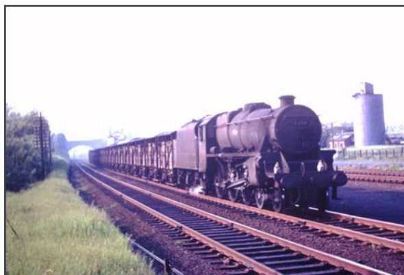
'Stanier' class 5 4-6-0, 45294, near Bebington on Sunday 11th June 1967 with the 18.40 Birkenhead-York cattle train. This was a regular working around this period, although not always to the same destination, for the transporting of cattle from Ireland which had arrived at the docks.