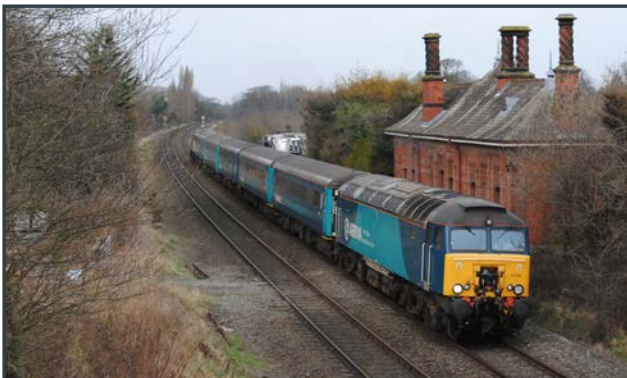
57315 (Arriva Trains Wales livery) with 57313 at the rear pass the old station building at Waverton on 12th March 2011 with the 08.08 Holyhead-Cardiff Central rugby special.