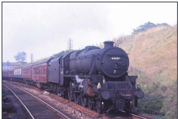
LMS Class 5 4-6-0 44897 passes Christleton with the 11.00 Windermere to London (Euston) which, on this occasion, had been diverted from the West Coast Main Line to run via Chester on the 16th September 1967. This would have been one of the last steam powered passenger trains to run from Chester to Crewe.

Spital - First in the timetable June 1846 and named Spittle for the first month. Much enlarged after four tracking took place.