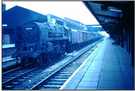
BR class 9F 2-10-0 92124 passes through Chester station on 4th July 1966 with a freight for Birkenhead. These were the largest locomotives to work on the network, apart from the relatively small number of Beyer Garratts and, towards the end of steam the class was synonymous with Birkenhead locomotive depot, it having in the region of fifty allocated there.

Rock Lane - Opened on 30.5.1846 and closed 1.11.1862 when it was replaced by the first Rock Ferry station which was in turn replaced by the second Rock Ferry station on 15.6.1891 situated a little further south. According to Bradshaw’s Railway Guide it was known as Rock Ferry Junction from this date and incorporated the Mersey Railway extension from Green Lane.