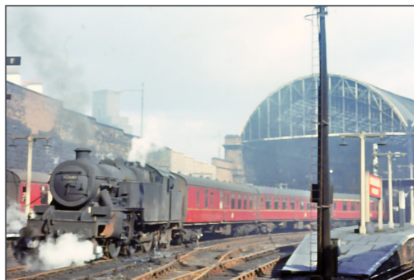
LMS 2-6-4T 42647 stands in Birkenhead's Woodside Station with the 12.00 departure for London Paddington on 26th February 1967, only two weeks before the final through service to London from this side of the Mersey.