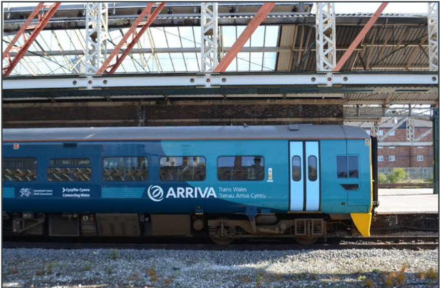
An Arriva Trains Wales class 158 diesel multiple unit having just arrived at Chester station.