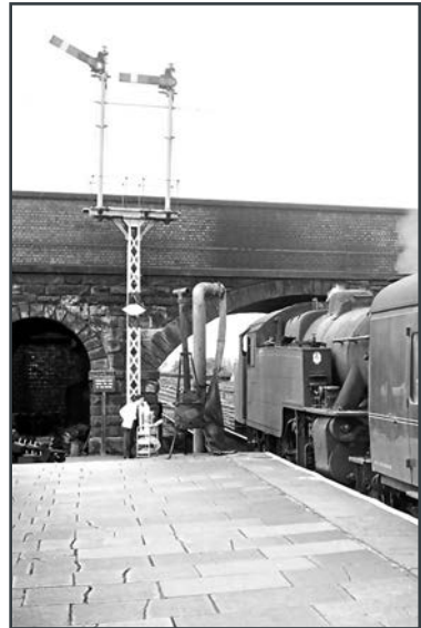
Fairburn 2-6-4T 42283 prepares to leave Hooton with the 09.10 Paddington - Birkenhead (Woodside) train on the 6th August 1965; a tea trolley can be seen waiting to cross once the train is clear.

Visitors still take the 'Sand Train' through Chester in to North Wales, passengers still enjoy days out on the Wirral and in Liverpool travelling by train and ferry. Commuters and business people travel to work and beyond with London Euston just over two hours away.