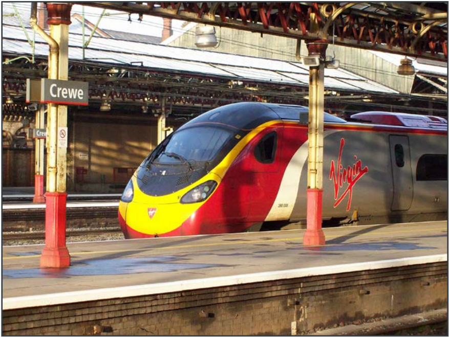
A Virgin Trains Pendolino class 390 calls at Crewe station.