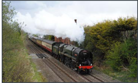
Preserved 'Britannia' 4-6-2 70000 "Britannia", itself, is seen southbound at Waverton with 'The Cathedrals Express' 1Z92 16.11 Chester to London Euston on 14th April 2012.

Chester - Opened in Brook Street on 23.9.1840 and closed on 1.8.1848 upon the opening of the Chester Joint station. The station is situated between two sets of fork junctions – at the east end lines to Crewe (ex-LNWR) and also to Helsby (ex-LNWR) and Northwich (ex-CLC, the Cheshire Lines Committee) as far as Mickle Trafford since the closure of Northgate, whilst to the west end are the lines to Birkenhead (ex-GWR & LNWR Joint) and also to Holyhead (ex LNWR) and Wrexham (ex-GWR) as far as Saltney Junction. The approach from the west end is via the once GWR locomotive depot (which became a diesel multiple unit depot and since rebuilt for use by Arriva Trains Wales' class 175 units for maintenance) and formerly under a most impressive signal gantry.