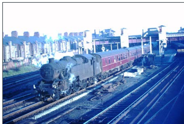
'Fairburn' 2-6-4T, 42086, nears journey's end as it leaves Rock Ferry in April 1966 with a Paddington to Woodside train. One of the 1956 built class 503 electric units, prior to the introduction of the class 507/508 units, waits in the bay with a train for Liverpool Central.