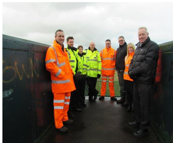
Inspection of the land and embankment prior to the partner clean up day